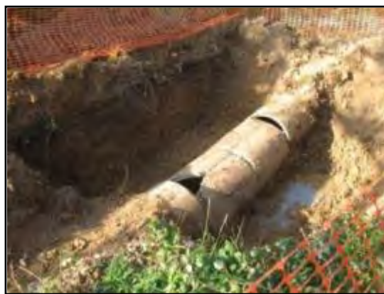
A damaged culvert requiring repair

Piped or 'culverted' watercourses are prone to blockage or collapse and will degrade over time. Where they naturally silt up they can be difficult to access and clean. Cleaning the inside of a culvert is likely to cost more than carrying out maintenance of an open watercourse, due to the specialist equipment required to access it.