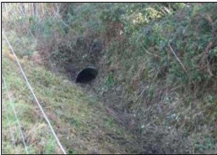
A ditch where silt has built up over the opening of an inlet pipe

Silt naturally builds up in watercourses as vegetation dies back each year. It can quickly reduce the capacity of a watercourse or block pipes into or out of the watercourse.