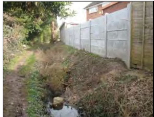
A riparian ditch in need of maintenance to remove vegetation, silt and debris

The principles of keeping a watercourse well maintained are very simple and the basic responsibility is to ensure “the proper flow of water” by preventing any obstructions. You should also ensure that it doesn’t attract vermin or cause a health hazard.